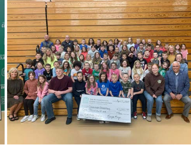
Youth Philanthropy Committee 2024 Graduates