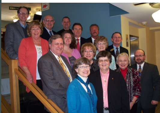
BOARD OF DIRECTORS 2013

The Foundation's total endowment, currently valued at $22 million in assets, is a pool of more than 237 individual funds established by donors. The endowment is permanent; granting dollars are produced by earnings and market growth. We are good stewards of our endowment and receive professional investment advice from Oxford Financial Group. As a result, our investment returns are higher than average for an endowment of our size. Investment returns since inception have averaged nearly 8% annually.