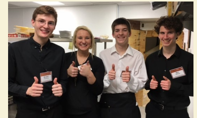
Youth Philanthropy Members at Almost Home fundraising event.

The goal of the Youth Philanthropy is to educate and encourage young leaders and philanthropists through youth-led, community initiatives.